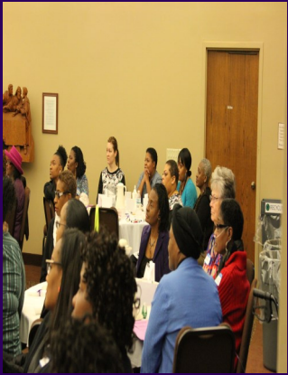
The audience listens intently to the message at the "Jump To The New You" event